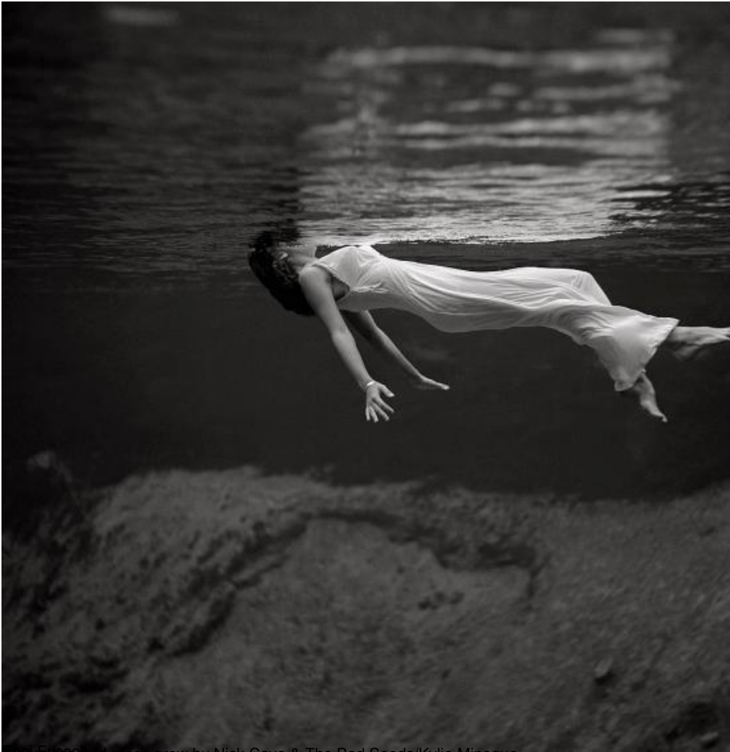
Where the wild roses grow by Nick Cave & The Bad Seeds/Kylie Minogue